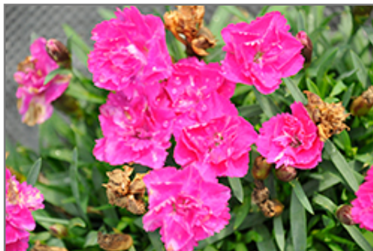
Beauties Melinda Pinks flowers

This is a relatively low maintenance plant, and is best cleaned up in early spring before it resumes active growth for the season. It is a good choice for attracting bees and butterflies to your yard, but is not particularly attractive to deer who tend to leave it alone in favor of tastier treats. It has no significant negative characteristics.