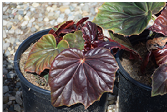
Red Fred Begonia foliage

This is a high maintenance plant that will require regular care and upkeep, and usually looks its best without pruning, although it will tolerate pruning. Deer don't particularly care for this plant and will usually leave it alone in favor of tastier treats. Gardeners should be aware of the following characteristic(s) that may warrant special consideration;