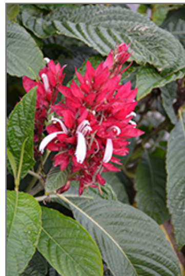
Brazilian Red Coat flowers

Brazilian Red Coat is recommended for the following landscape applications;