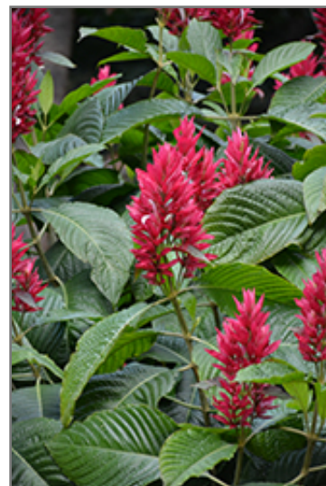
Brazilian Red Coat flowers