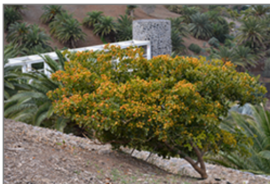
Rough Bark Lignum Vitae fruit

Rough Bark Lignum Vitae is a multi-stemmed evergreen tree with an upright spreading habit of growth. Its average texture blends into the landscape, but can be balanced by one or two finer or coarser trees or shrubs for an effective composition.