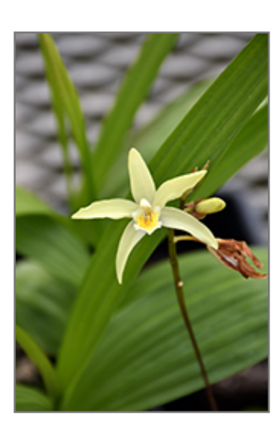
Lavender Japanese Hyacinth Orchid flowers

This is an herbaceous houseplant with an upright spreading habit of growth. This plant may benefit from an occasional pruning to look its best.