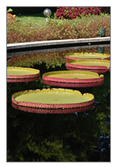
Santa Cruz Tropical Water Lily

This plant will require occasional maintenance and upkeep, and should be cut back in late fall in preparation for winter. It has no significant negative characteristics.