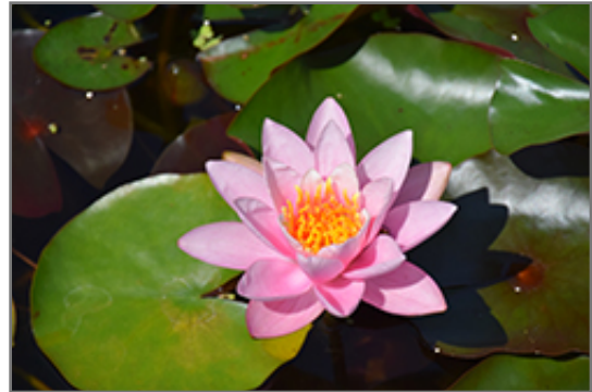
Norma Gedye Hardy Water Lily flowers

Norma Gedye Hardy Water Lily is ideally suited for growing in a pond, water garden or patio water container, and is recommended for the following landscape applications;