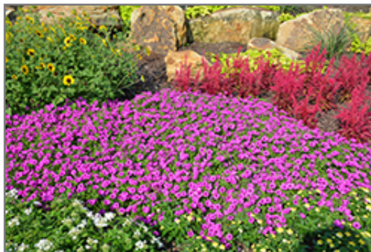
Supertunia Mini Vista Sweet Sangria Petunia in bloom

Supertunia Mini Vista Sweet Sangria Petunia is a fine choice for the garden, but it is also a good selection for planting in outdoor containers and hanging baskets. Because of its trailing habit of growth, it is ideally suited for use as a 'spiller' in the 'spiller-thriller-filler' container combination; plant it near the edges where it can spill gracefully over the pot. Note that when growing plants in outdoor containers and baskets, they may require more frequent waterings than they would in the yard or garden.