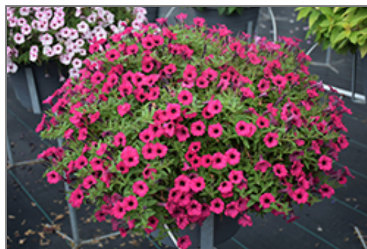
Supertunia Mini Vista Sweet Sangria Petunia in bloom