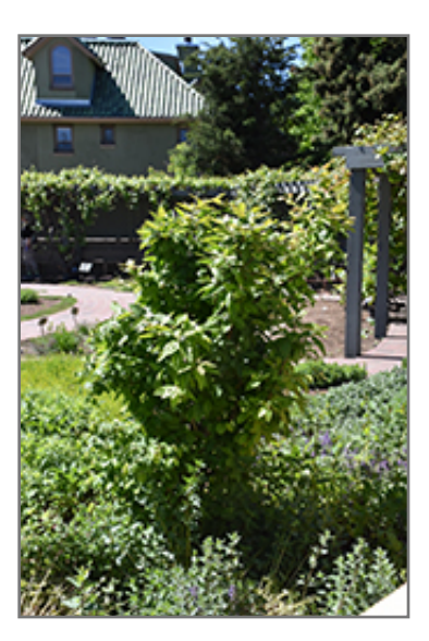
Marron Medlar

Marron Medlar is clothed in stunning white cup-shaped flowers at the ends of the branches in mid spring. It has green deciduous foliage. The fuzzy pointy leaves turn red in fall. The fruits are showy coppery-bronze hips which fade to dark brown over time, which are carried in abundance from mid summer to mid fall.