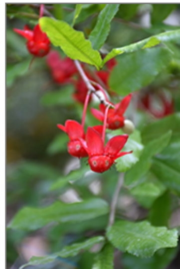
Mickey Mouse Plant flowers

Mickey Mouse Plant is an open multi-stemmed deciduous shrub with an upright spreading habit of growth. Its average texture blends into the landscape, but can be balanced by one or two finer or coarser trees or shrubs for an effective composition.