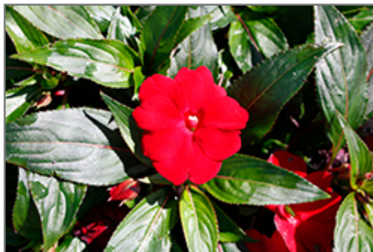
Clockwork Red New Guinea Impatiens flowers