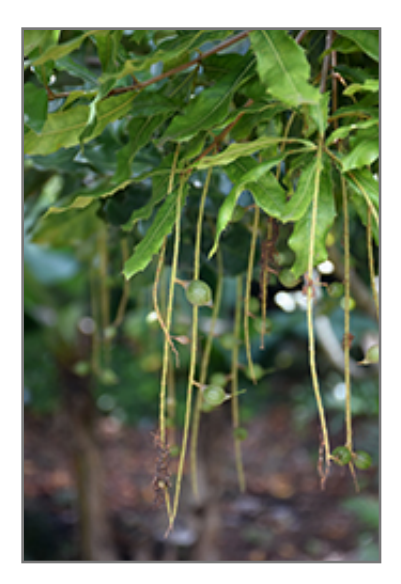
Beaumont Macadamia Nut fruit