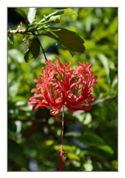
Fringed Hibiscus flowers