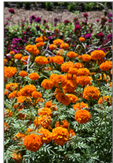
Xochi Orange Marigold flowers