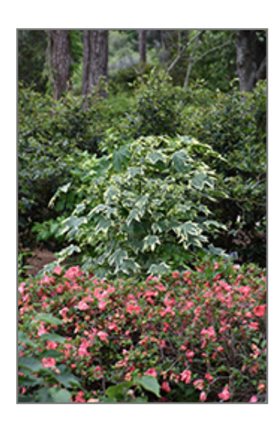
Savitzii Flowering Maple

When grown indoors, Savitzii Flowering Maple can be expected to grow to be about 4 feet tall at maturity, with a spread of 3 feet. It grows at a fast rate, and under ideal conditions can be expected to live for approximately 20 years. This houseplant will do well in a location that gets either direct or indirect sunlight, although it will usually require a more brightly-lit environment than what artificial indoor lighting alone can provide. It does best in average to evenly moist soil, but will not tolerate standing water. The surface of the soil shouldn't be allowed to dry out completely, and so you should expect to water this plant once and possibly even twice each week. Be aware that your particular watering schedule may vary depending on its location in the room, the pot size, plant size and other conditions; if in doubt, ask one of our experts in the store for advice. It will benefit from a regular feeding with a general-purpose fertilizer with every second or third watering. It is not particular as to soil type or pH; an average potting soil should work just fine.