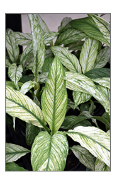
Jessica Peace Lily foliage

When grown indoors, Jessica Peace Lily can be expected to grow to be about 3 feet tall at maturity, with a spread of 3 feet. It grows at a medium rate, and under ideal conditions can be expected to live for approximately 10 years. This houseplant performs well in both bright or indirect sunlight and strong artificial light, and can therefore be situated in almost any well-lit room or location. It prefers to grow in average to moist soil. The surface of the soil shouldn't be allowed to dry out completely, and so you should expect to water this plant once and possibly even twice each week. Be aware that your particular watering schedule may vary depending on its location in the room, the pot size, plant size and other conditions; if in doubt, ask one of our experts in the store for advice. It will benefit from a regular feeding with a general-purpose fertilizer with every second or third watering. It is particular about its soil conditions, with a strong preference for rich, acidic soil. Contact the store for specific recommendations on pre-mixed potting soil for this plant. Be warned that parts of this plant are known to be toxic to humans and animals, so special care should be exercised if growing it around children and pets.