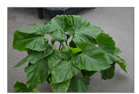
Giant Philodendron in full

When grown indoors, Giant Philodendron can be expected to grow to be about 15 feet tall at maturity, with a spread of 8 feet. It grows at a fast rate, and under ideal conditions can be expected to live for approximately 10 years. This houseplant performs well in both bright or indirect sunlight and strong artificial light, and can therefore be situated in almost any well-lit room or location. It does best in average to evenly moist soil, but will not tolerate standing water. The surface of the soil shouldn't be allowed to dry out completely, and so you should expect to water this plant once and possibly even twice each week. Be aware that your particular watering schedule may vary depending on its location in the room, the pot size, plant size and other conditions; if in doubt, ask one of our experts in the store for advice. It will benefit from a regular feeding with a general-purpose fertilizer with every second or third watering. It is not particular as to soil type or pH; an average potting soil should work just fine. Be warned that parts of this plant are known to be toxic to humans and animals, so special care should be exercised if growing it around children and pets.