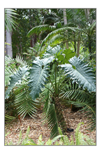
Evans' Philodendron

When grown indoors, Evans' Philodendron can be expected to grow to be about 6 feet tall at maturity, with a spread of 5 feet. It grows at a medium rate, and under ideal conditions can be expected to live for approximately 30 years. This houseplant performs well in both bright or indirect sunlight and strong artificial light, and can therefore be situated in almost any well-lit room or location. It prefers to grow in average to moist soil. The surface of the soil shouldn't be allowed to dry out completely, and so you should expect to water this plant once and possibly even twice each week. Be aware that your particular watering schedule may vary depending on its location in the room, the pot size, plant size and other conditions; if in doubt, ask one of our experts in the store for advice. It will benefit from a regular feeding with a general-purpose fertilizer with every second or third watering. It is not particular as to soil type or pH; an average potting soil should work just fine. Be warned that parts of this plant are known to be toxic to humans and animals, so special care should be exercised if growing it around children and pets.