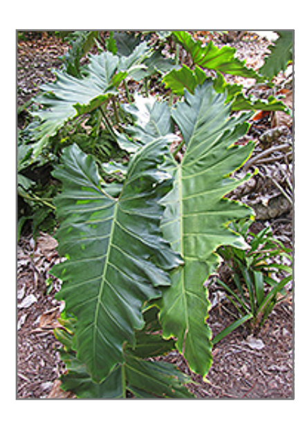
Philodendron eichleri

When grown indoors, Philodendron eichleri can be expected to grow to be about 3 feet tall at maturity, with a spread of 4 feet. It grows at a fast rate, and under ideal conditions can be expected to live for approximately 10 years. This houseplant performs well in both bright or indirect sunlight and strong artificial light, and can therefore be situated in almost any well-lit room or location. It prefers to grow in average to moist soil. The surface of the soil shouldn't be allowed to dry out completely, and so you should expect to water this plant once and possibly even twice each week. Be aware that your particular watering schedule may vary depending on its location in the room, the pot size, plant size and other conditions; if in doubt, ask one of our experts in the store for advice. It will benefit from a regular feeding with a general-purpose fertilizer with every second or third watering. It is not particular as to soil type or pH; an average potting soil should work just fine. Be warned that parts of this plant are known to be toxic to humans and animals, so special care should be exercised if growing it around children and pets.