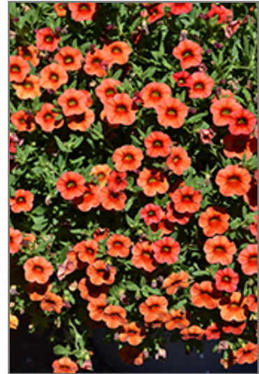
Cha-Cha Orange Calibrachoa flowers

This plant will require occasional maintenance and upkeep. Trim off the flower heads after they fade and die to encourage more blooms late into the season. It is a good choice for attracting bees and hummingbirds to your yard, but is not particularly attractive to deer who tend to leave it alone in favor of tastier treats. It has no significant negative characteristics.