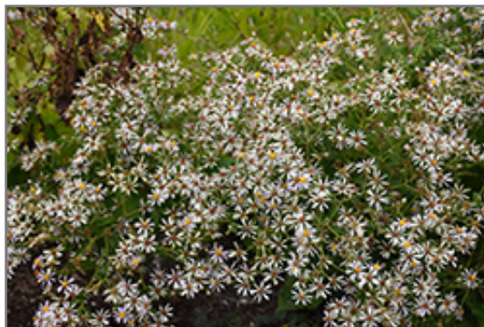
White Wood Aster flowers

White Wood Aster is recommended for the following landscape applications;