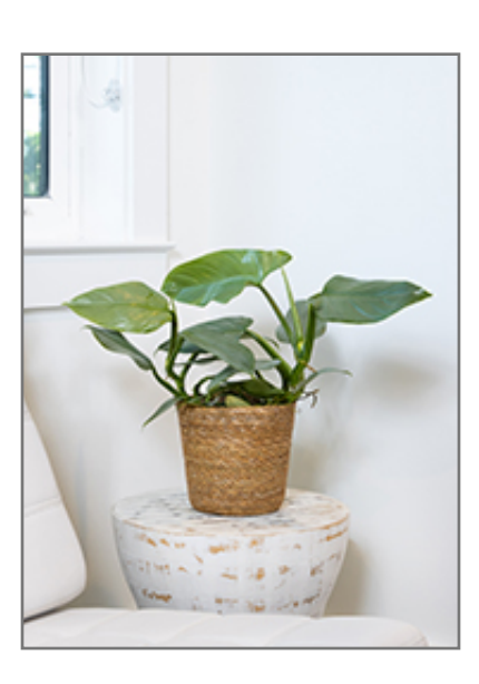
Prismacolor Hastatum Silver Sword Philodendron in full

When grown indoors, Prismacolor Hastatum Silver Sword Philodendron can be expected to grow to be about 10 feet tall at maturity, with a spread of 3 feet. It grows at a fast rate, and under ideal conditions can be expected to live for approximately 10 years. This houseplant performs well in both bright or indirect sunlight and strong artificial light, and can therefore be situated in almost any well-lit room or location. It does best in average to evenly moist soil, but will not tolerate standing water. The surface of the soil shouldn't be allowed to dry out completely, and so you should expect to water this plant once and possibly even twice each week. Be aware that your particular watering schedule may vary depending on its location in the room, the pot size, plant size and other conditions; if in doubt, ask one of our experts in the store for advice. It will benefit from a regular feeding with a general-purpose fertilizer with every second or third watering. It is not particular as to soil type or pH; an average potting soil should work just fine. Be warned that parts of this plant are known to be toxic to humans and animals, so special care should be exercised if growing it around children and pets.