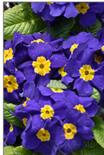
Pacific Giant Blue Primrose flowers