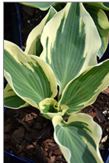
Firn Line Hosta