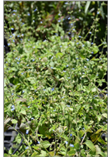
Southern River Sage flowers