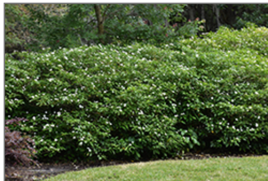
Crepe Jasmine in bloom

Crepe Jasmine is a dense multi-stemmed evergreen shrub with an upright spreading habit of growth. Its relatively coarse texture can be used to stand it apart from other landscape plants with finer foliage.