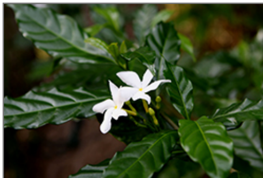
Crepe Jasmine flowers

Crepe Jasmine makes a fine choice for the outdoor landscape, but it is also well-suited for use in outdoor pots and containers. Its large size and upright habit of growth lend it for use as a solitary accent, or in a composition surrounded by smaller plants around the base and those that spill over the edges. It is even sizeable enough that it can be grown alone in a suitable container. Note that when grown in a container, it may not perform exactly as indicated on the tag - this is to be expected. Also note that when growing plants in outdoor containers and baskets, they may require more frequent waterings than they would in the yard or garden.