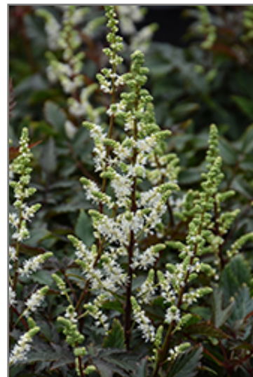
Happy Spirit Astilbe flowers

A compact and clump-forming variety presenting creamy white flowers held on long, upright plumes; dark red stems rise above dark green, fern-like foliage; an excellent addition to shaded gardens, borders, containers or moon gardens; low maintenance