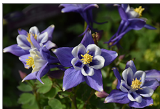
Earlybird Blue and White Columbine flowers