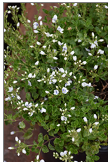
Snowmass Blue-Eyed Veronica flowers

This plant will require occasional maintenance and upkeep, and is best cleaned up in early spring before it resumes active growth for the season. It is a good choice for attracting butterflies to your yard, but is not particularly attractive to deer who tend to leave it alone in favor of tastier treats. It has no significant negative characteristics.