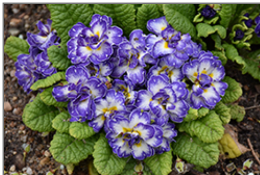
BELARINA Blue Ripples Primrose in bloom