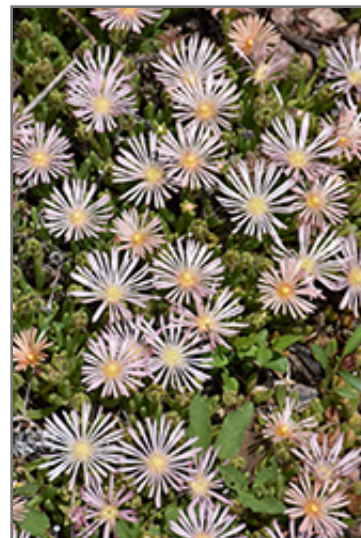
Alan's Apricot Ice Plant flowers