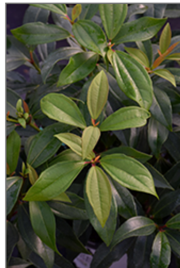
Yang Viburnum foliage

Yang Viburnum is recommended for the following landscape applications;