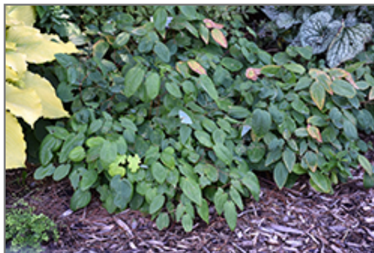
Rigoletto Barrenwort

Rigoletto Barrenwort is recommended for the following landscape applications;