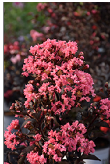
Center Stage Coral Crapemyrtle flowers

Center Stage Coral Crapemyrtle is recommended for the following landscape applications;