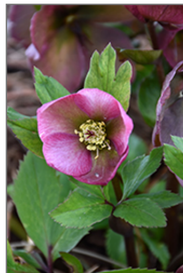
HGC Madame Lemonnier Hellebore flowers