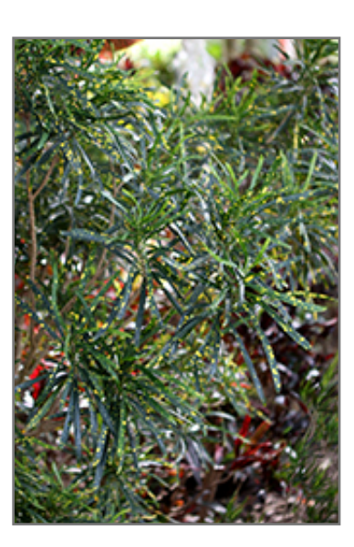
Gold Dust Narrow Leaf Croton foliage

When grown indoors, Gold Dust Narrow Leaf Croton can be expected to grow to be about 6 feet tall at maturity, with a spread of 4 feet. It grows at a medium rate, and under ideal conditions can be expected to live for approximately 10 years. This houseplant will do well in a location that gets either direct or indirect sunlight, although it will usually require a more brightly-lit environment than what artificial indoor lighting alone can provide. It does best in average to evenly moist soil, but will not tolerate standing water. The surface of the soil shouldn't be allowed to dry out completely, and so you should expect to water this plant once and possibly even twice each week. Be aware that your particular watering schedule may vary depending on its location in the room, the pot size, plant size and other conditions; if in doubt, ask one of our experts in the store for advice. It will benefit from a regular feeding with a general-purpose fertilizer with every second or third watering. It is not particular as to soil pH, but grows best in rich soil. Contact the store for specific recommendations on pre-mixed potting soil for this plant. Be warned that parts of this plant are known to be toxic to humans and animals, so special care should be exercised if growing it around children and pets.