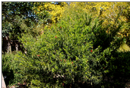
Coral Bush