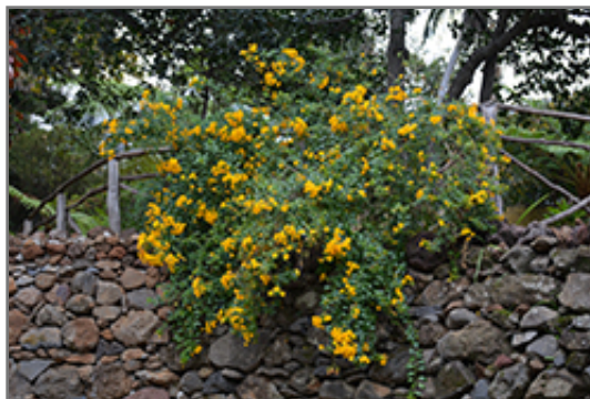
Yellow Marmalade Bush in bloom

Yellow Marmalade Bush is recommended for the following landscape applications;