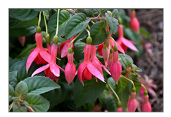
Coachman Fuchsia flowers