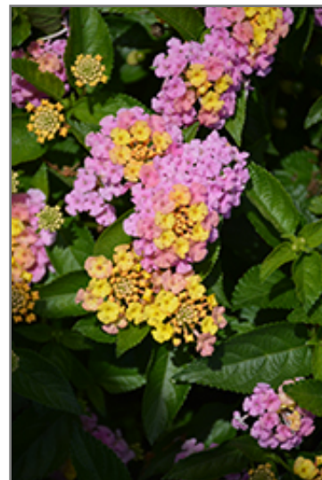
Havana Sunrise Lantana flowers

This is a relatively low maintenance plant, and should not require much pruning, except when necessary, such as to remove dieback. It is a good choice for attracting butterflies and hummingbirds to your yard, but is not particularly attractive to deer who tend to leave it alone in favor of tastier treats. It has no significant negative characteristics.