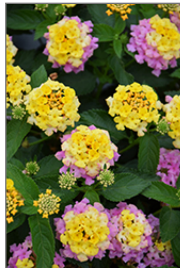
Havana Sunrise Lantana flowers

Havana Sunrise Lantana is a fine choice for the garden, but it is also a good selection for planting in outdoor containers and hanging baskets. It is often used as a 'filler' in the 'spiller-thriller-filler' container combination, providing a mass of flowers against which the thriller plants stand out. Note that when growing plants in outdoor containers and baskets, they may require more frequent waterings than they would in the yard or garden.