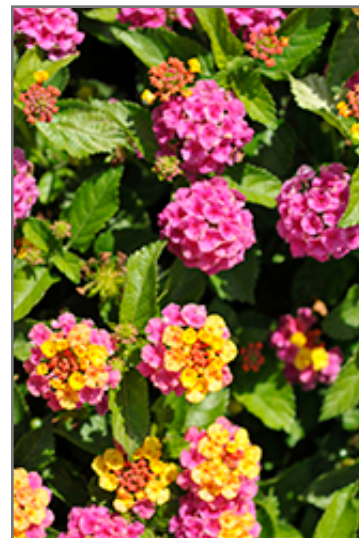
Havana Cherry Lantana flowers

Havana Cherry Lantana is recommended for the following landscape applications;