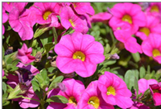
Unique Pink Calibrachoa flowers

Unique Pink Calibrachoa is recommended for the following landscape applications;