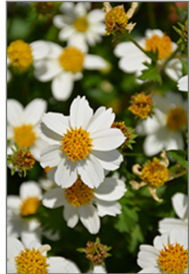
White Delight Bidens flowers

White Delight Bidens is recommended for the following landscape applications;