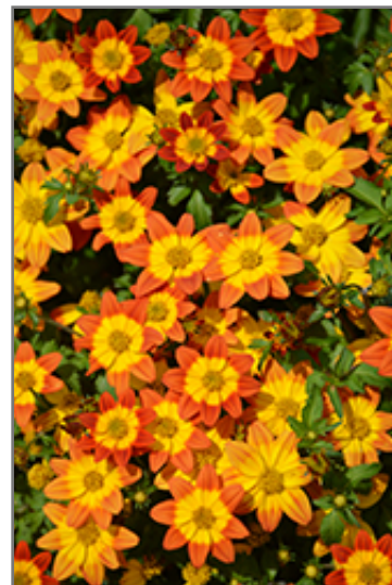
Blazing Glory Bidens flowers

Blazing Glory Bidens is recommended for the following landscape applications;