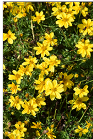
Bidy Gonzales Big Bidens flowers

Bidy Gonzales Big Bidens is recommended for the following landscape applications;