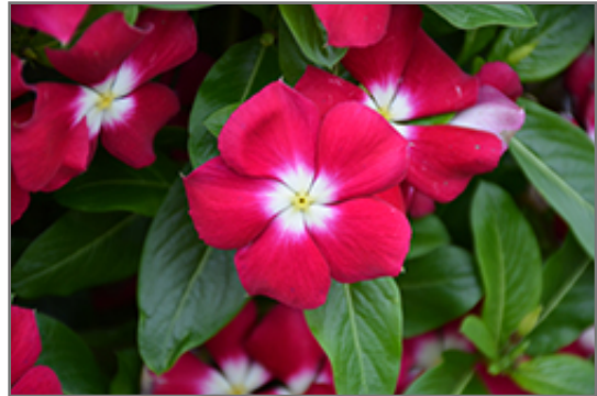
Mediterranean XP Burgundy Halo Vinca flowers

Mediterranean XP Burgundy Halo Vinca is a dense herbaceous annual with a trailing habit of growth, eventually spilling over the edges of hanging baskets and containers. Its medium texture blends into the garden, but can always be balanced by a couple of finer or coarser plants for an effective composition.