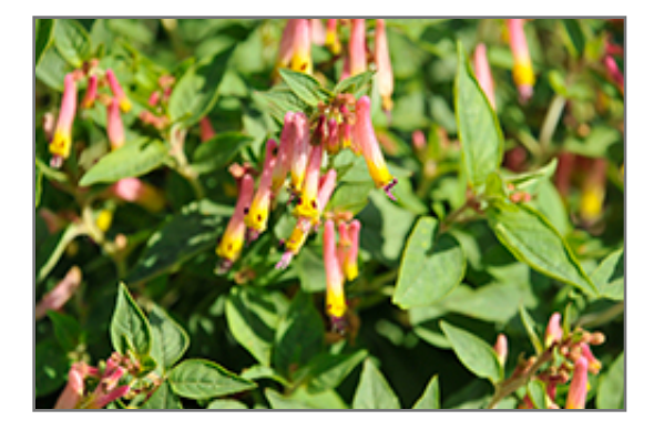
Funny Face Cuphea flowers

Funny Face Cuphea will grow to be about 12 inches tall at maturity, with a spread of 12 inches. Its foliage tends to remain dense right to the ground, not requiring facer plants in front. This annual will normally live for one full growing season, needing replacement the following year.