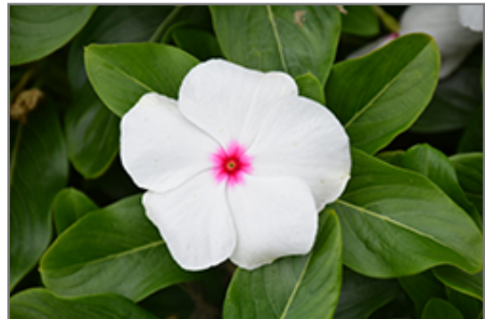
Blockbuster Peppermint Vinca flowers