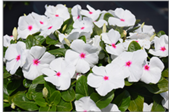
Blockbuster Peppermint Vinca flowers

Blockbuster Peppermint Vinca is recommended for the following landscape applications;