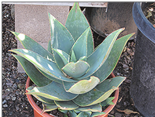
Ghost Aloe Photo courtesy of NetPS Plant Finder

Ghost Aloe is recommended for the following landscape applications;