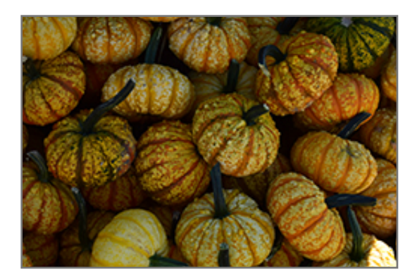
Warty Gnome Pumpkin fruit

This plant is typically grown in a designated vegetable garden. It should only be grown in full sunlight. It does best in average to evenly moist conditions, but will not tolerate standing water. It is not particular as to soil pH, but grows best in rich soils. It is somewhat tolerant of urban pollution. Consider applying a thick mulch around the root zone over the growing season to conserve soil moisture. This is a selection of a native North American species.; however, as a cultivated variety, be aware that it may be subject to certain restrictions or prohibitions on propagation.